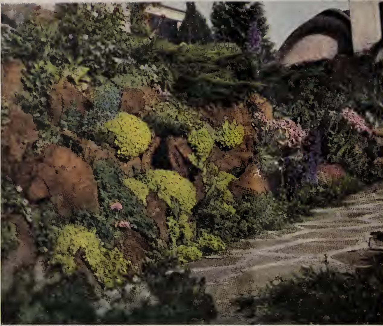
Splendid Use of Rock Garden Plants.

● This beautiful picture shows what a Rock Garden may be with a proper placing of the rocks, good soil preparation and a wise selection of plants.